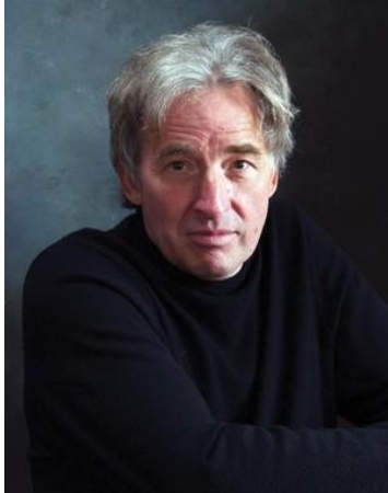
Robert Ludlum's Personal Physician, Confidant and Nephew